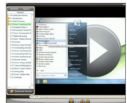
Presenter-led lessons and demonstrations guide users, step-by-step, through key concepts of using computers and the Internet