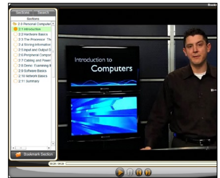
Friendly online presenters make learning about computers easy and inviting