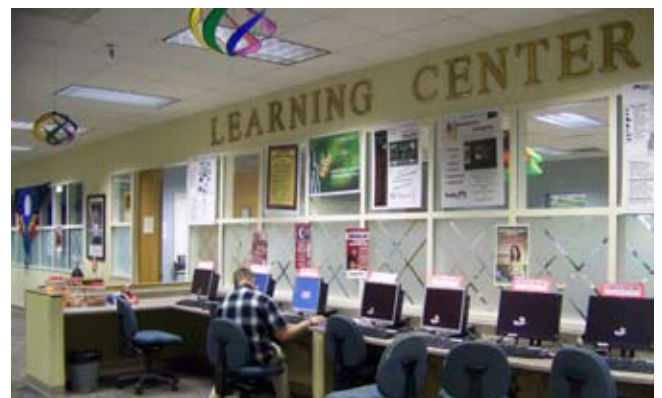
Learning Center at the Pueblo Campus

Implementation of the LearningExpress Library Platform has been a significant savings for PCC's operating budget, while out-performing the previous resources. According to Ross Barnhart, "LearningExpress costs much less than our previous resource. The others had limited access, both in terms of number of possible concurrent users as well as being network based, not Internet based. The cost of LearningExpress Library fit us well! The ease-of-use saves us staffing, time and money."